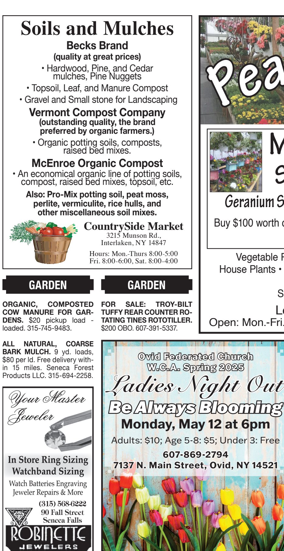
April 30, 2025 • Seneca County Area Shopper 7